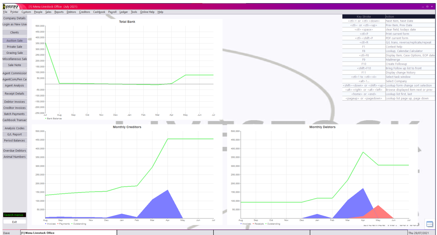
Figure 2: Dashboard Example