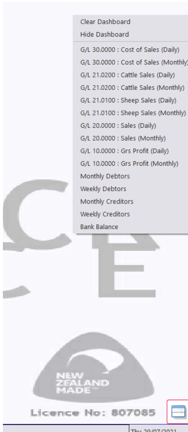
Figure 1: Dashboard Options

Click on the dashboard icon at the bottom right of your Livestock Office application to open the Dashboard options.