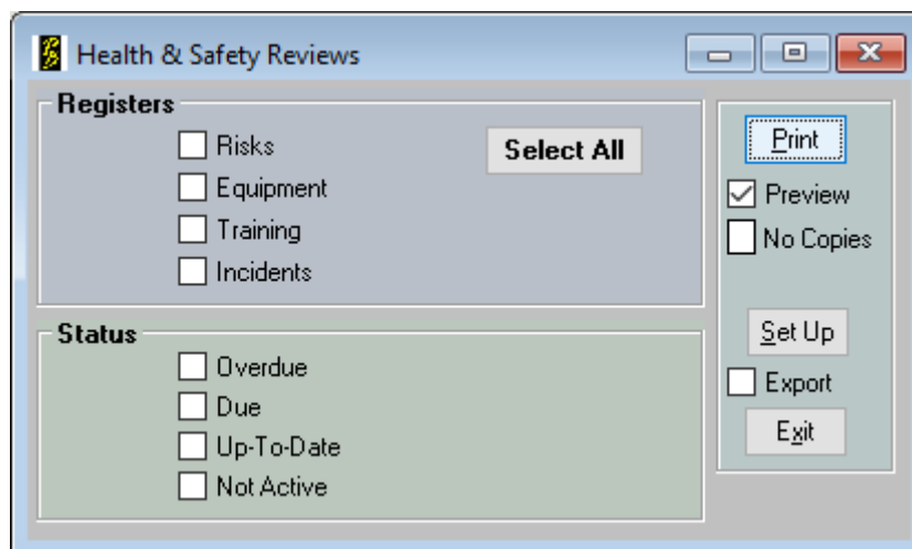
Figure 1: H&S Reviews

A flexible means of reporting on the H&S Reviews by Status.