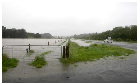
Surface flooding on SH3 – Wanganui, 15 Oct

Thankfully LivestockOffice is such a reliable and stable program, it's a pleasure to use that you forget what's happening outside.